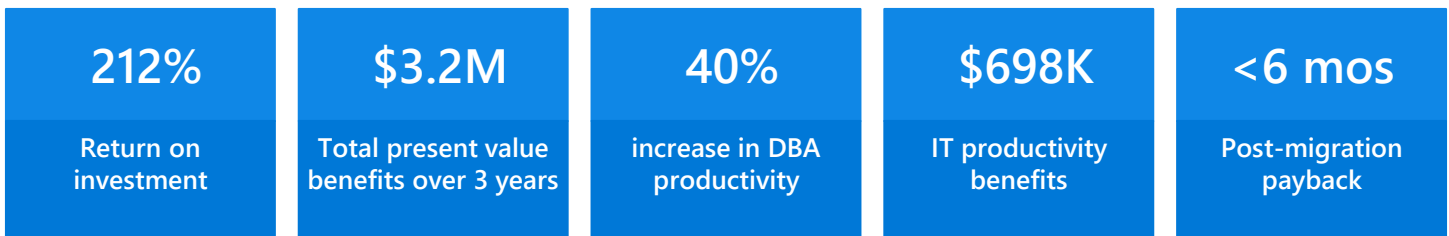
The Total Economic Impact™ of Azure SQL Database Managed Instance, Forrester Consulting, October 2018

It is time to move your data to the cloud. Companies that moved their on-premises and hosted data to Azure SQL Database can see real benefits and cost savings, making Azure SQL Database the most economical destination for your SQL Server databases.