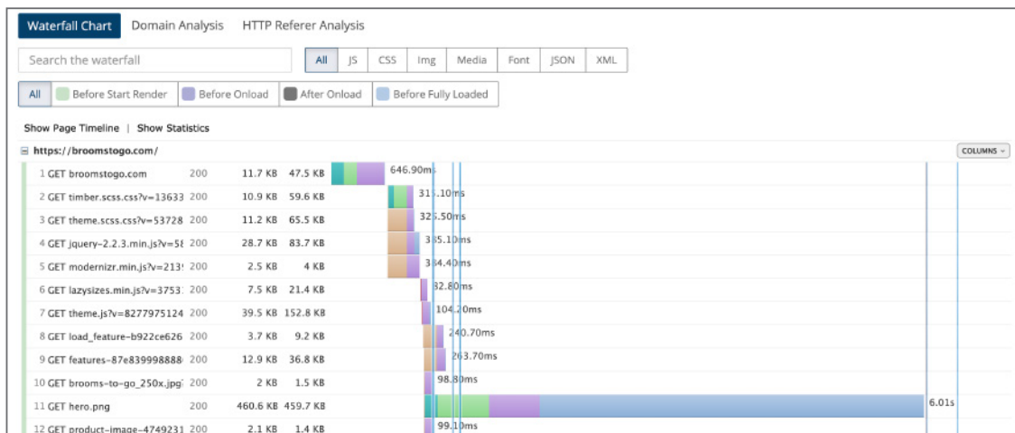
The waterfall chart displays every asset on a website as it loads at its individual times. This chart is one of the benefits of synthetic monitoring as it helps teams better understand the causes of performance regressions.

The second, and more powerful, use case for optimization tools is to use them as part of the